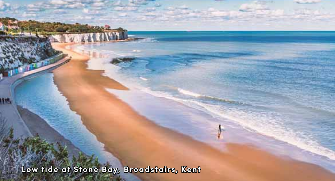
Low tide at Stone Bay, Broadstairs, Kent