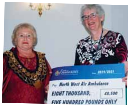
South East Lancashire Branch

Oddfellows CEO, Jane Nelson, added: "It always astounds me when we look at the collective yearly fundraising figure. The generosity of our members and Branches, especially at such times where household budgets are becoming increasingly tight and unpredictable, is incredible.