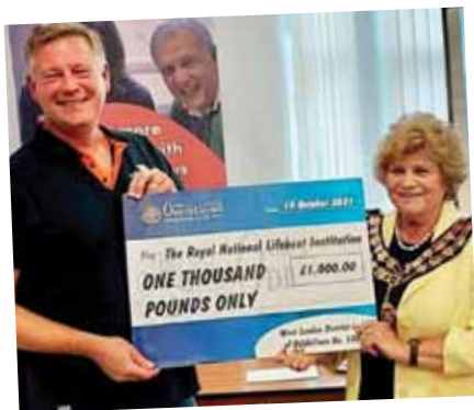
West London Branch