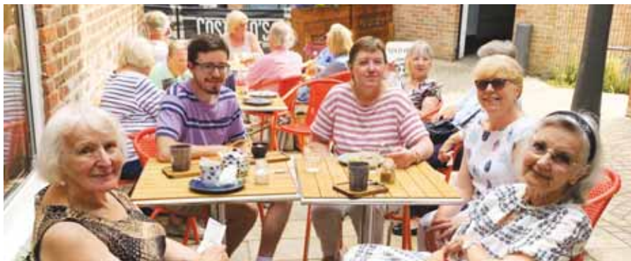
Delicious pancakes at a Handforth and Altrincham event.