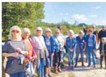
Earl of Cottenham Branch