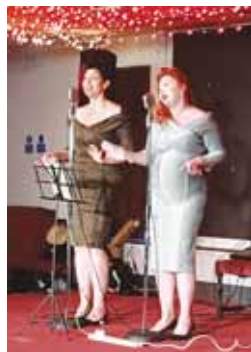
The Moxie Dolls.

such as Hold Tight; Don't Sit Under The Apple Tree; and It's Too Darn Hot. After the break they sang some more modern songs in their own style such as I Will Survive; Diamonds Are Forever; and Oops I Did It Again! Several members got up to dance to the music.