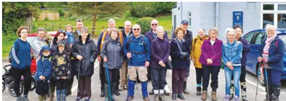
The Three Crowns Ramblers.