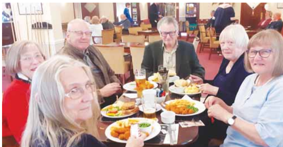
Members enjoying the lunchtime get-together.

Much hilarity as numbers and (mostly) correct noises and names were called out. Has anyone ever heard of 53 – koala up a tree!? A good afternoon with lots of chat and laughter.