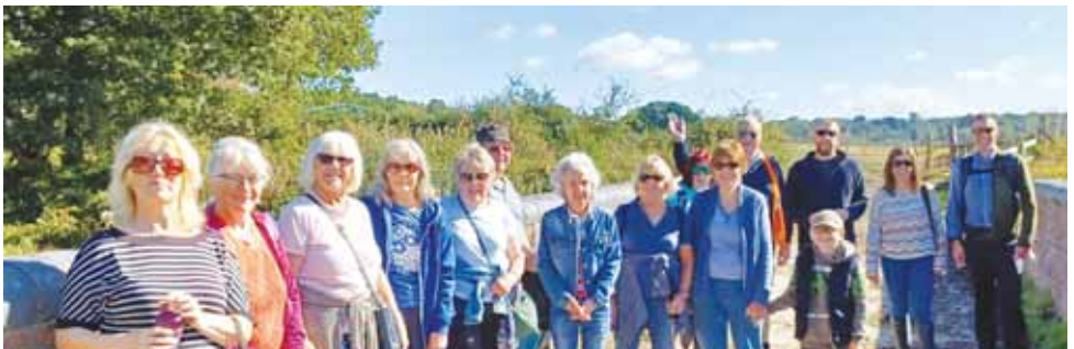
The Green Man Ramblers.

Eighteen members and guests plus a dog were blessed with a warm sunny September day for a 3.5 mile circular walk from The Green Man pub in Horsted Keynes. On the way we visited St Giles’ Church to see the grave of former Prime Minister Harold Macmillan and his family. The walk took us through some beautiful countryside and we also crossed over the Bluebell Railway. Sadly we only heard the steam trains. We arrived back at the pub two hours later for a thoroughly deserved lunch and a drink or two.