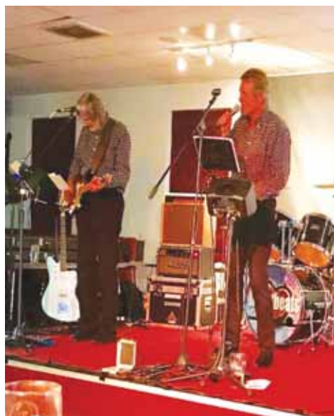
Heartbeats - Tuesday 13 February