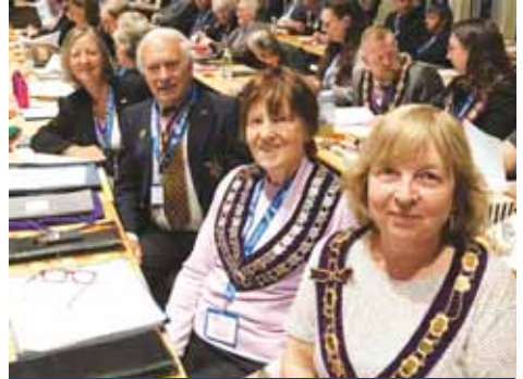
Delegates at AMC 2023.