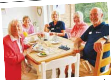
Brighton and Sussex members enjoying a coffee morning.

Take a look at some of the fun that's been had by some of our Branches!