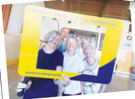
A friendly game of badminton in Mid-Surrey.