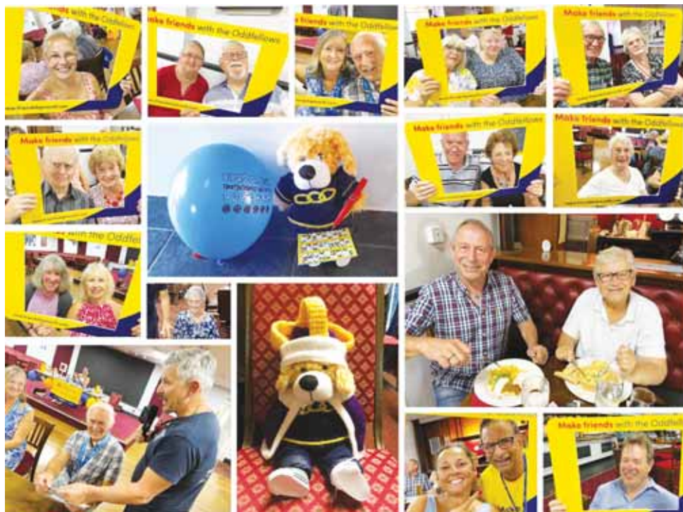
Getting into the Friendship Spirit.