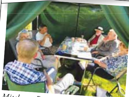
Mitcham, Reigate and Crawley friends keeping cool from the sunshine.