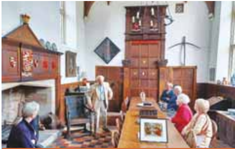
Sackville College - The Great Hall.

learnt at school or college, but passed down to them by their forbears. A thoroughly interesting and informative talk.