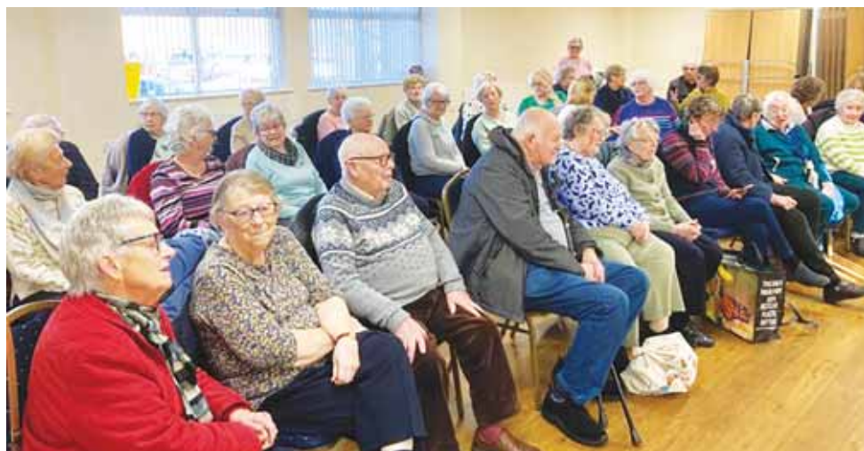
Wiltshire Farm Foods.