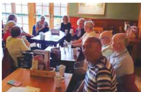
Globe coffee morning.