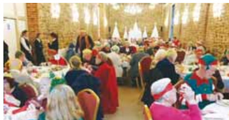
Members at our Christmas lunch.