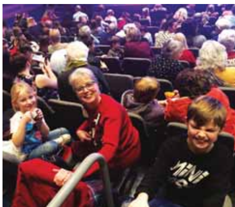
Members at the panto.