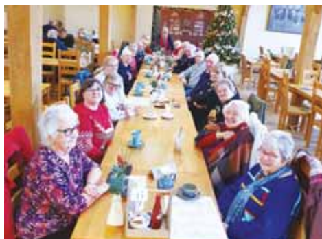
Baytree at Hilgay.