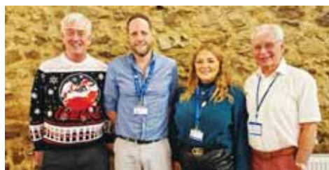
Mind at our Christmas lunch.