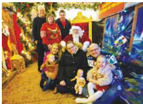
Seeing Santa at Hilgay Garden Centre.