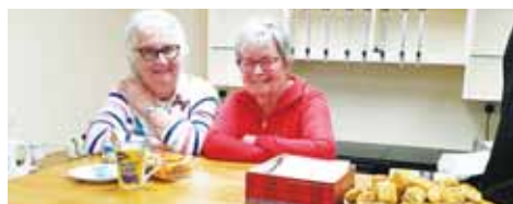
Our lovely Tea Ladies.