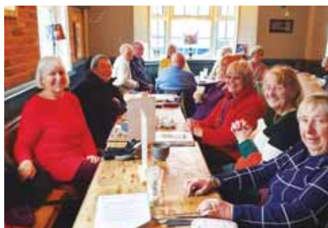
Coffee morning at Wildfowler.