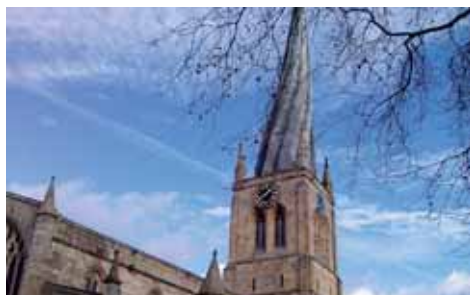
Church of St Mary and All Saints, Chesterfield

Welcome to our latest newsletter, we had a super 2019 and we look forward to a busy and social 2020.