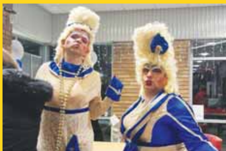
The ugly sisters