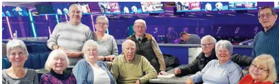
Some of our bowlers

Every month a few of our members enjoy a game of tenpin bowling, we have a great laugh and time for a chat afterwards with a nice hot drink and biscuits.