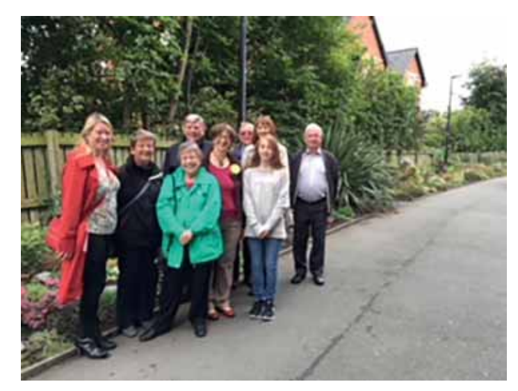
Members gathering for the walk around Altrincham to see the floral displays.

In August, we had a fabulous walk around Altrincham to see the floral displays and all the hard work put in to make Altrincham a cleaner, greener and safer place. We were delighted to