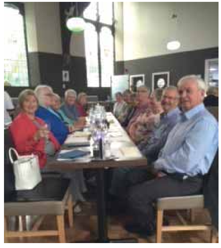
We've enjoyed wonderful lunches at Buckley's Restaurant, Warrington College and The Clink at Styal Prison and had a laugh at our coffee mornings (The Chocolate Box in Prestbury) and enjoyed icecream at Seven Sisters Farm in Knutsford.