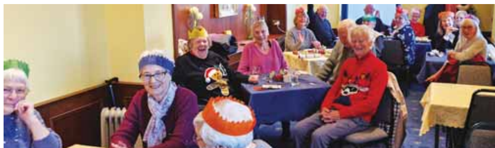
Brighouse members had a wonderful time at the Christmas Light Lunch, held at our Oddfellows Hall.