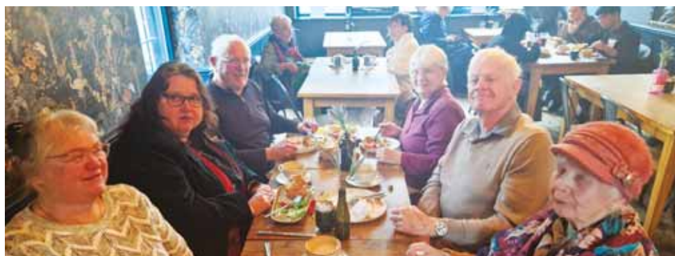
Members from Victory enjoyed a lovely visit to Vanilla Bean, Slaithwaite. The food was lovely and the staff were very friendly, we enjoyed it that much we've added into the new diary twice!