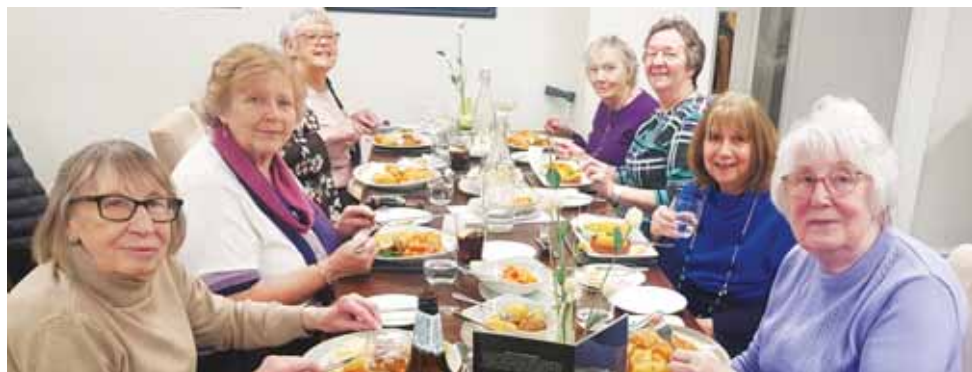
Members of Plantagenet enjoyed a lovely meal at the Rhubarb Lunch to celebrate the Rhubarb Festival in Wakefield.