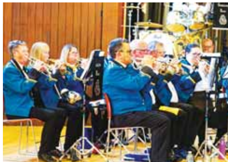
Hitting all the right notes.

The concert took place on Sunday 21 September and we had 60 members and guests in attendance. We cannot thank the band and attendees enough for making it a truly memorable afternoon.