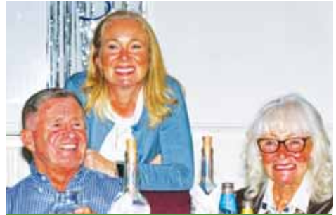
It's a family affair!

2025 was a great year for us, and our Friendship Month event was no exception. Thank you so much to those of you who came along and showed your support, and thank you to those of you who brought new friends with you – and welcome to those new friends who have joined us! We know you won't regret your decision to join us, check out some of the photos below.