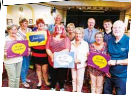
Brighouse and Huddersfield Oddfellows