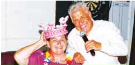
Our Prov GM was treated like the Queen!