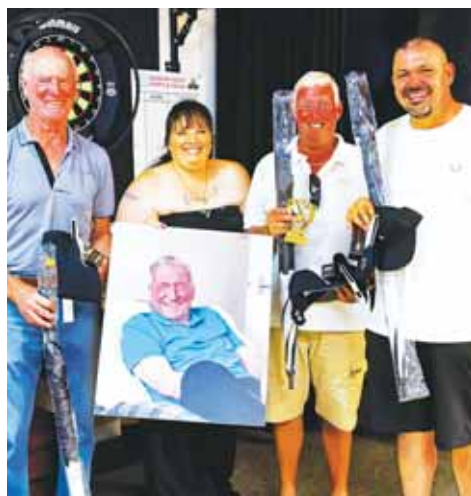
The 2025 Polly Watts Memorial Golf Day Winning Team.

Well done and thank you so much to all who took part.