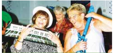
Us Oddfellows love a good boogie!