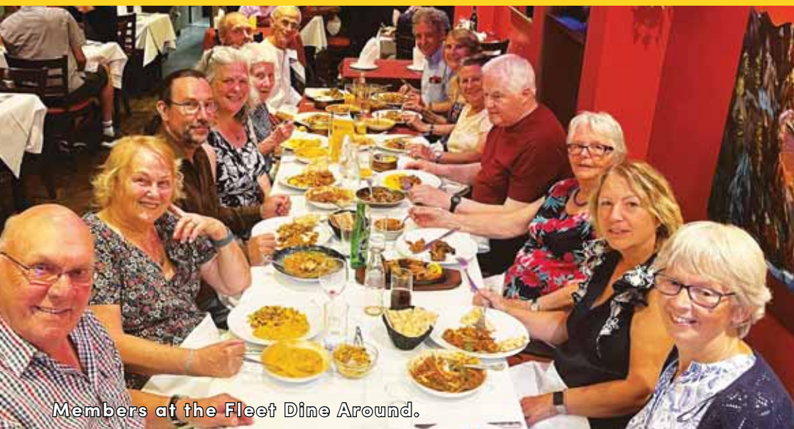
Members at the Fleet Dine Around.

Covering West Surrey and North East Hampshire