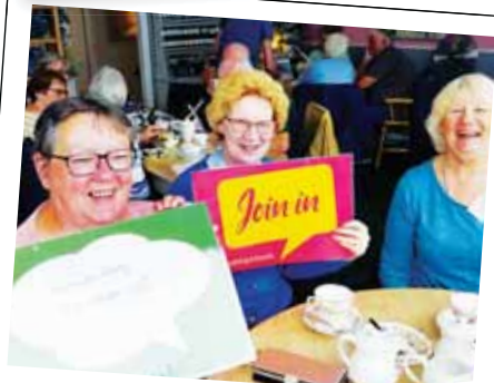
Heart of the West Oddfellows