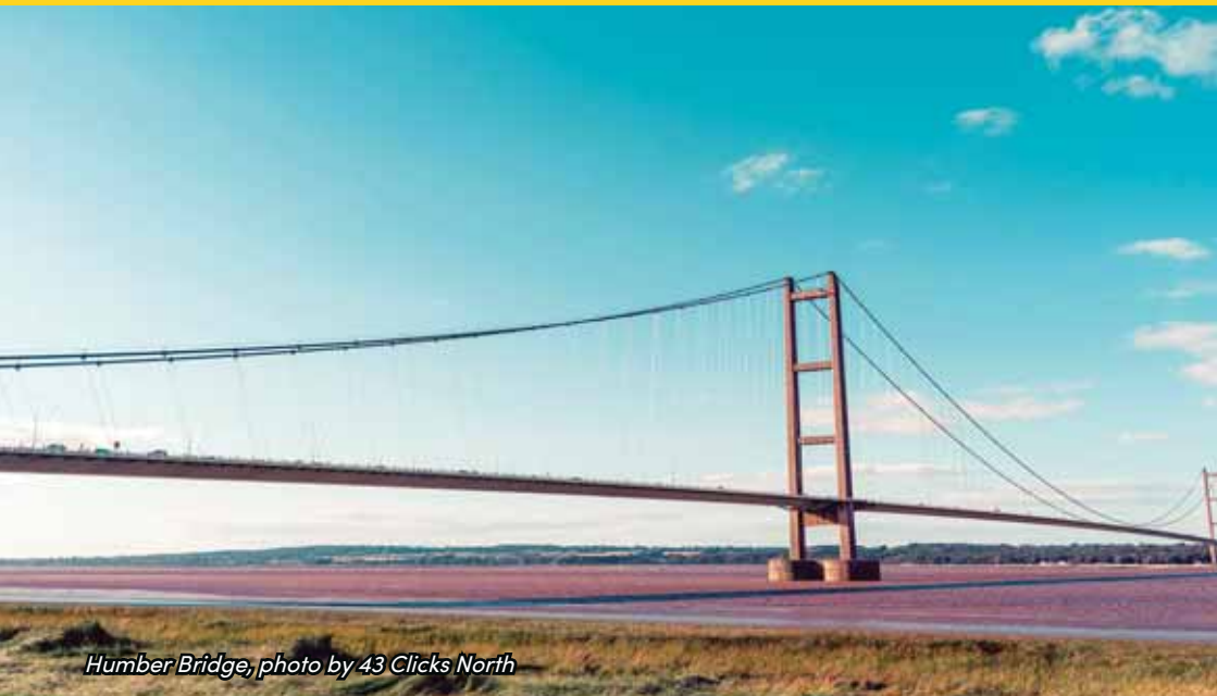
Humber Bridge