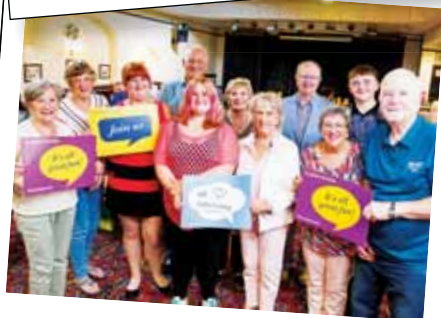
Brighouse and Huddersfield Oddfellows