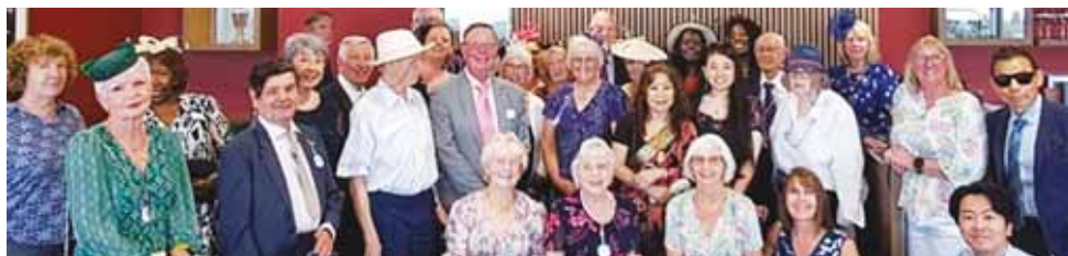
Reading District Members and visitors enjoying a day out at Ascot Horse Races.

Welcome to the Reading District of the Oddfellows. The Branches in the District have organised an exciting and varied programme of events for you all. This Events Diary is a handy guide for you to keep so that you know what is happening in your area.