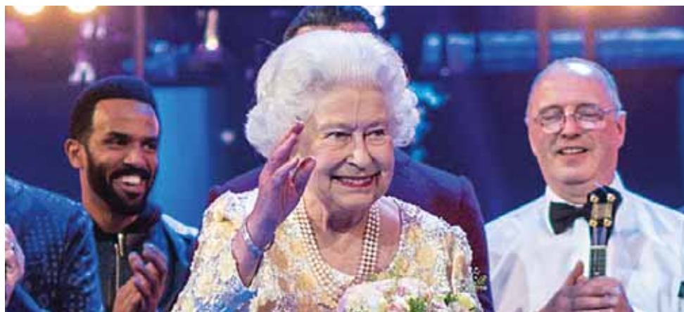
Queen's Platinum Jubilee Party - Tuesday 21 June

Welcome to the latest edition of the South East Lancashire Branch Events Diary. Members of the Branch have organised a varied programme of events for you all.