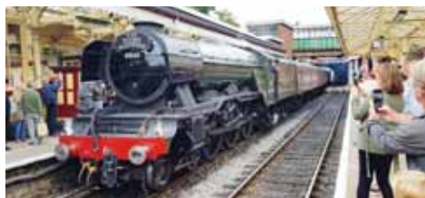
The Flying Scotsman pulling into Platform 3 of Bury Bolton Street headed by 60103 Flying Scotsman.

Picture above: Some of the Oddfellows who enjoyed the trip on the 'Flying Scotsman' at the side of the iconic engine.