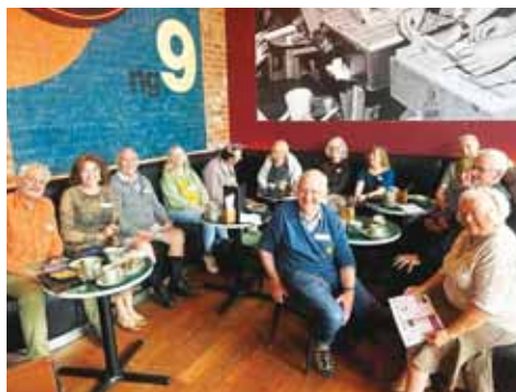
Our new Coffeefellows Group at Beeston Social