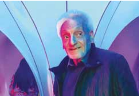
Architects of Air Luminarium