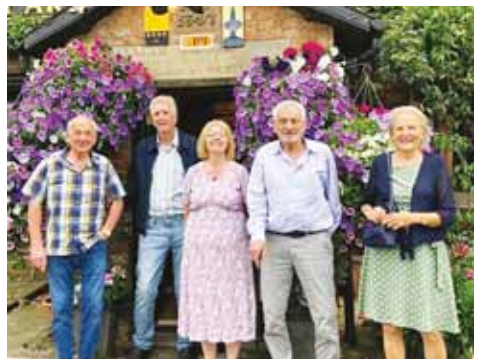
Sunday Lunch at The Welby Arms, Allington