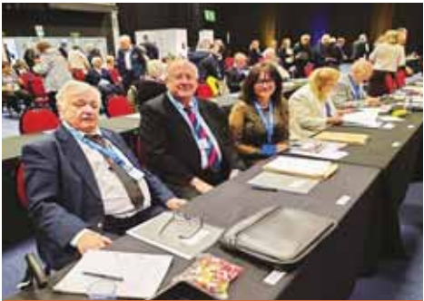
AMC Deputies 2024