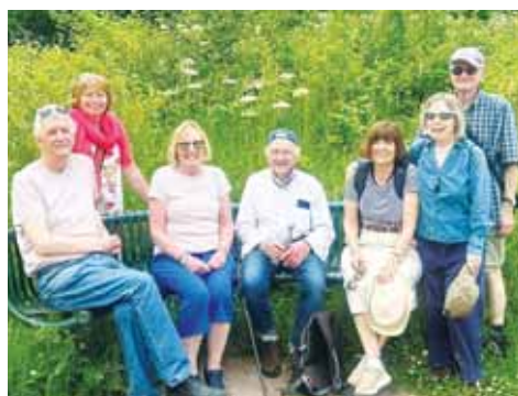
A lovely walk in Cotgrave Country Park