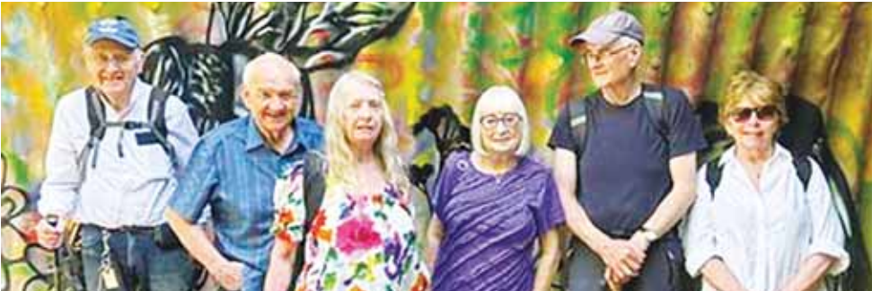
A nice walk to the Mucky Duck