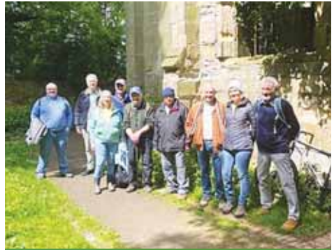
A walk in Colwick Country Park