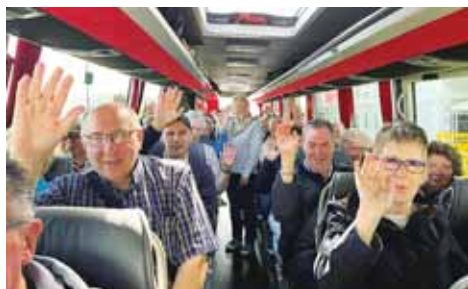
Oddies on the coach to Portmeirion

As well as business, attendees enjoyed a range of social activities, with Oddfellows Brass putting on another wonderful performance.