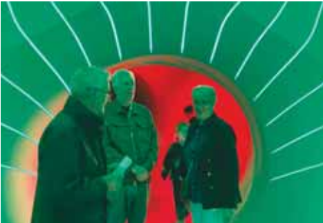
Members having fun at Architects of Air