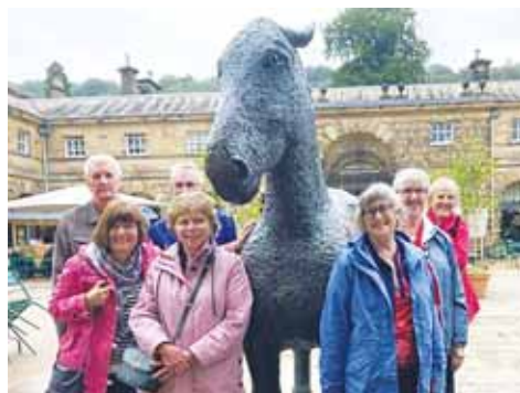
Peak Siteepeer open top bus trip