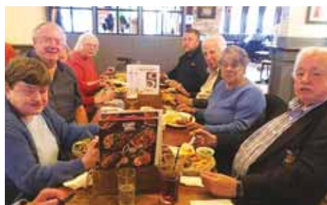
Prince of Peace Lodge meal out