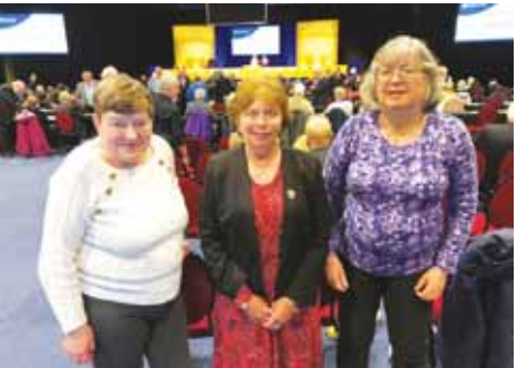
AMC visitors 2024