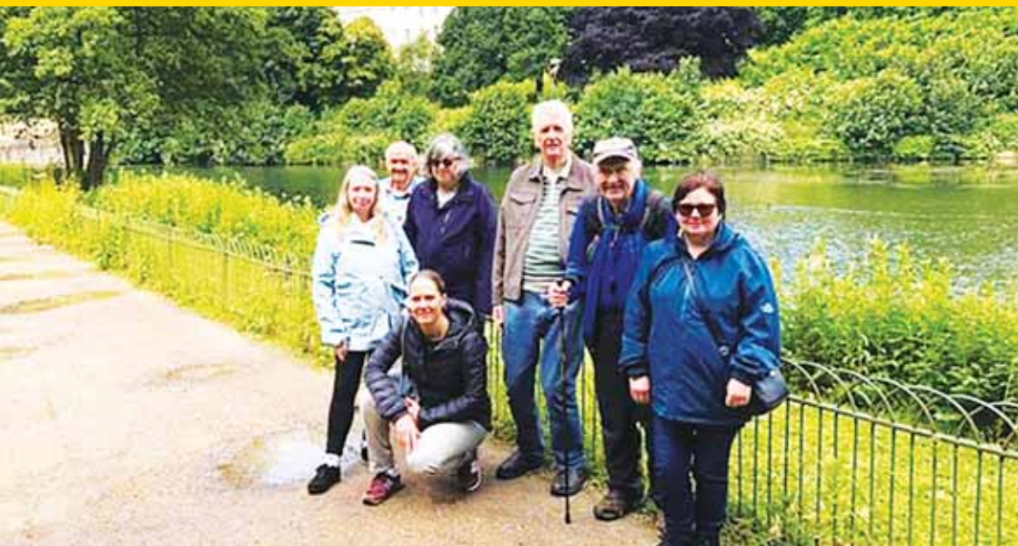
A walk around the University Park