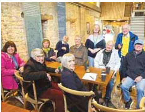
Visit to Woolsthorpe Manor, home of Isaac Newton