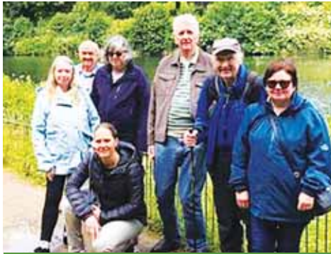
A walk around the University Park