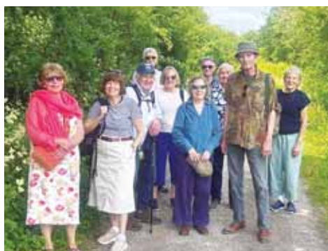
Cotgrave Country Park