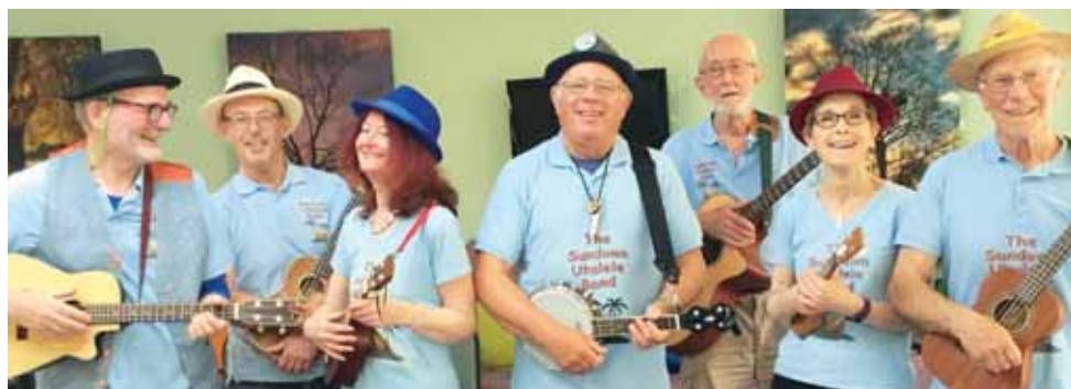
Sundown Ukulele Band – Thursday 26 May