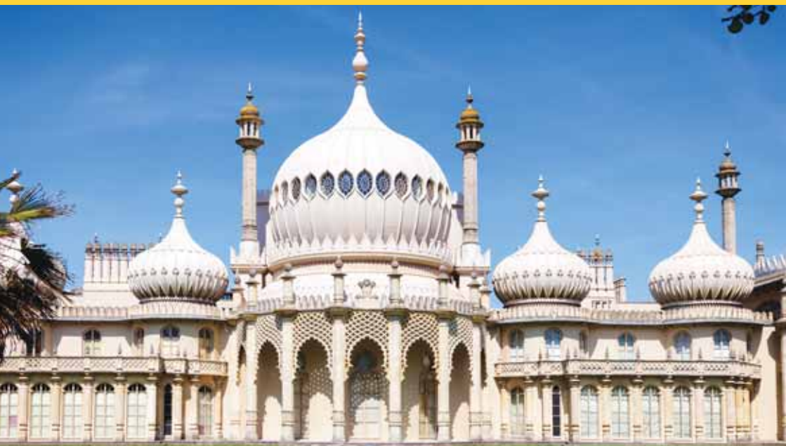
The Royal Pavilion in Brighton