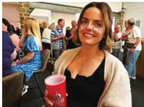
Denroyd Farm, Denby Dale.