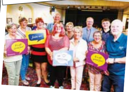
Brighouse and Huddersfield Oddfellows