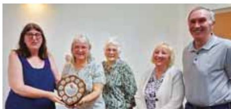
Inter District Quiz.

Our team did us proud and won a place at the final, which took place at Carlton House, Bradford. They were worthy runners up, with only a point separating