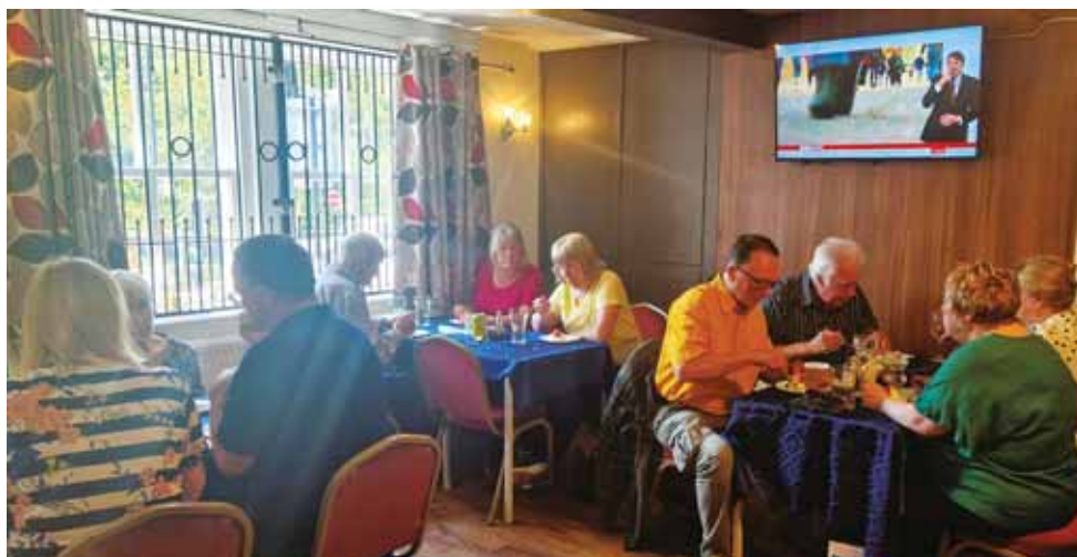
Three Course Light Lunch.

Members enjoying our Three Course Light Lunch at our Oddfellows Hall in Denshaw. Open to members and friends every month.