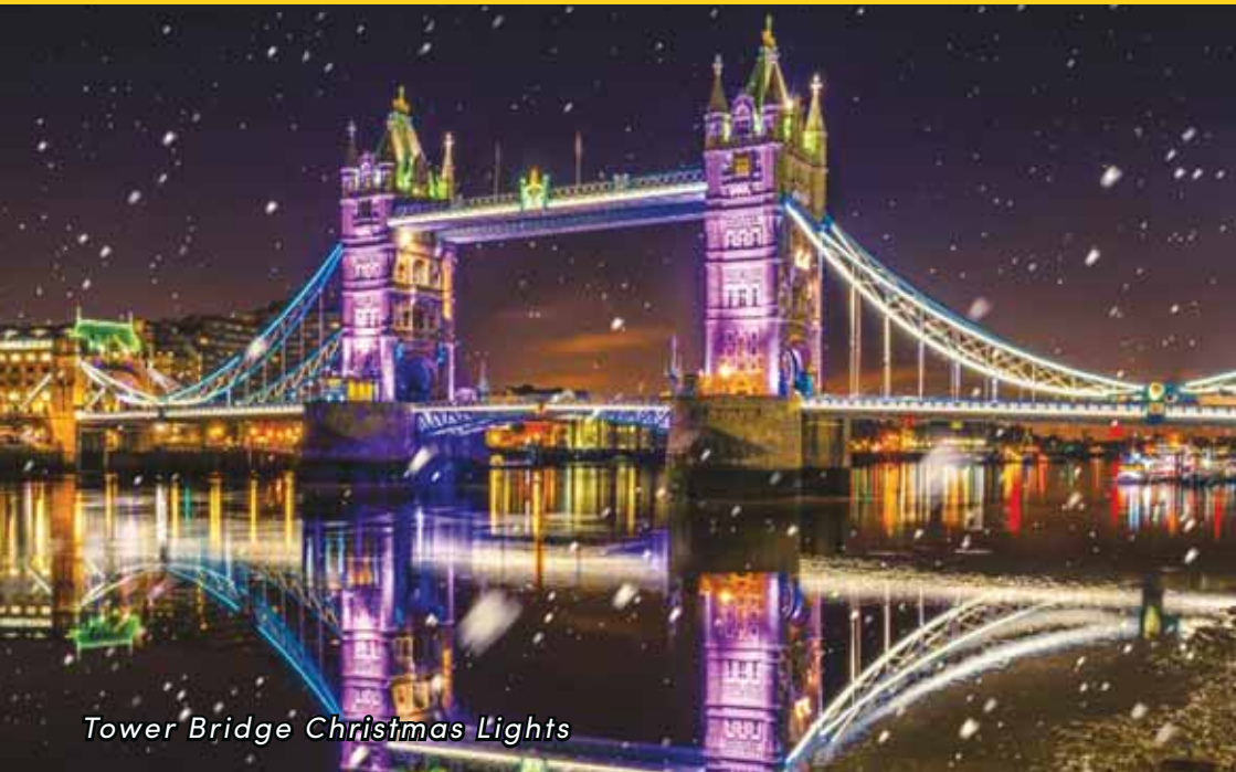
Tower Bridge Christmas Lights