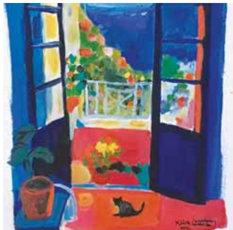
Cat in Window.