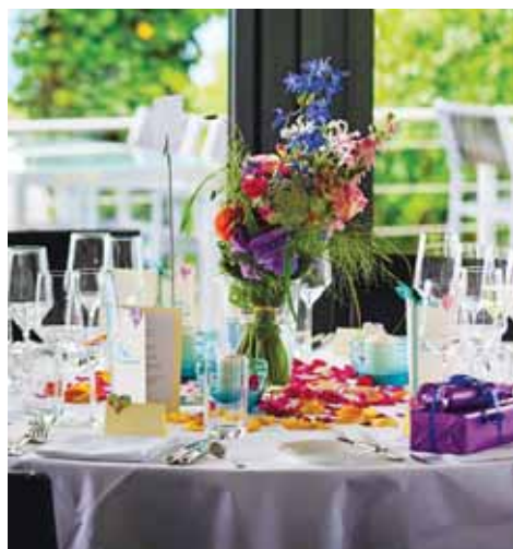
Annual Celebration Lunch Sunday 27 April