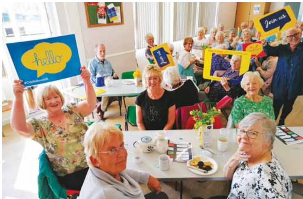
Our regular get together at Upton Victory Hall starting Friendship Month off with a hearty hello!