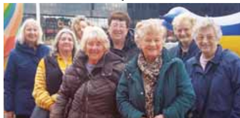
With the iconic Superlambananas at the front of the museum.

Quite a few of us enjoyed a visit round the Museum of Liverpool at the Pier Head on Friday 18 October 2024.