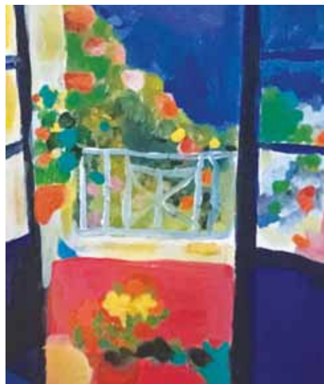
View from window (cat has escaped over the balcony – Ed!).

I'm really pleased to share some pictures with you from Keith Wike, a regular attendee of the Art Unscrewed Sessions with Dulcie Rowe, which are held online via zoom on a monthly basis.