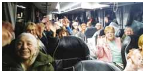
All dressed up with somewhere to go – Bury Market here we come!