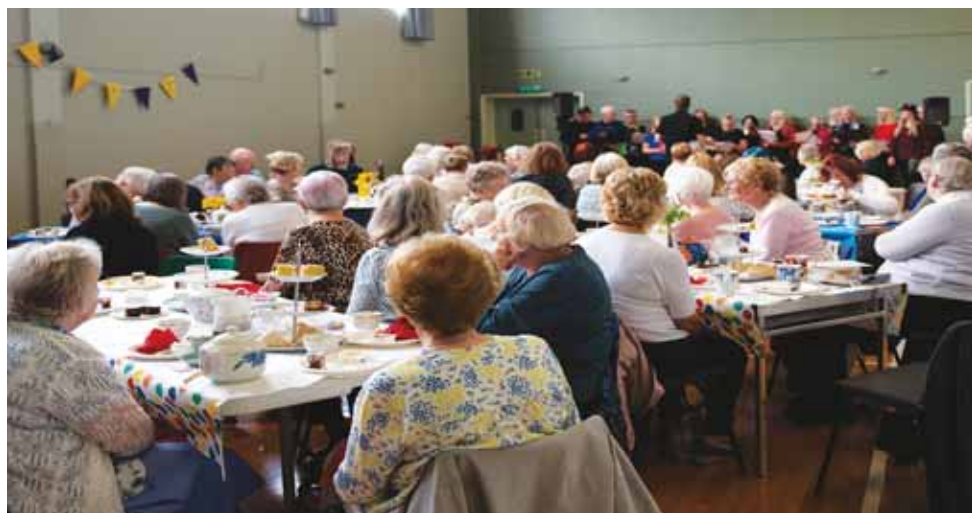
Afternoon Tea with choir at Upton Victory Hall.