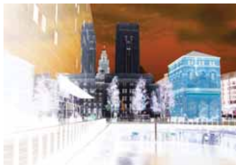
This is the negative of the same photo.

Gordon Charters is a keen photographer and below is an example of what can be done with clever photography, with an explanation by Gordon himself.