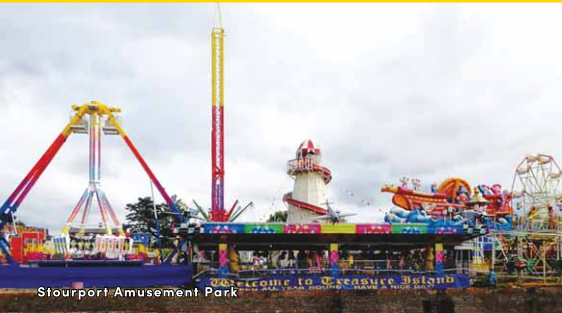
Stourport Amusement Park