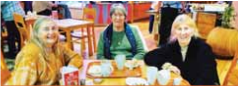
Barton Grange, November 2025