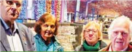
Barton Grange, November 2025