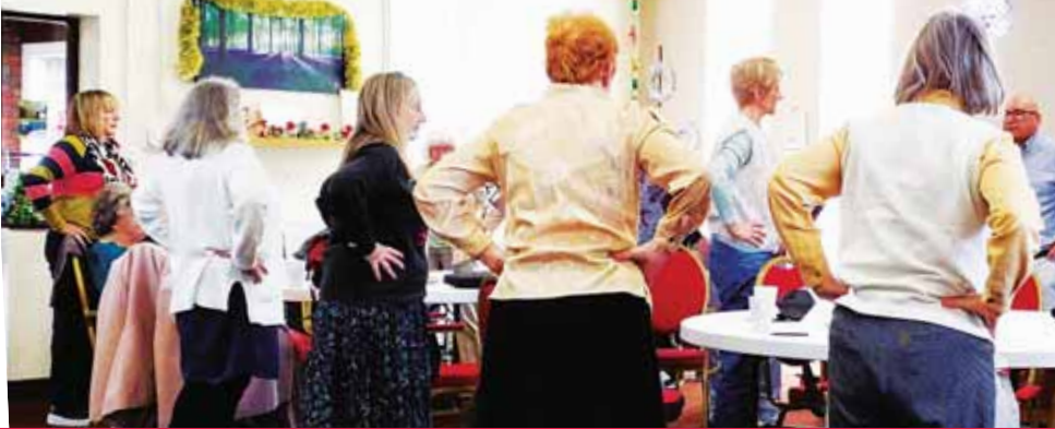
10 minute exercise class at Saltney coffee morning