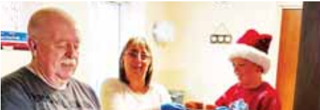
Fundraising, November 2025