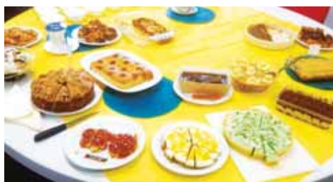
Pudding Taster - January 2026