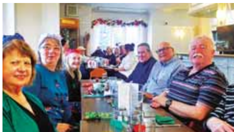
Christmas Meal at Flint Mountain Park Hotel - December 25