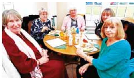
The Orangery, Derwen College, Oswestry - February 2026