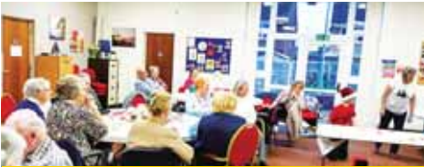
Fundraising, November 2025