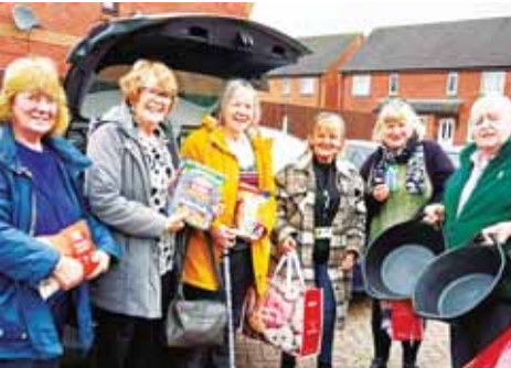
Ark Angels Charity donation