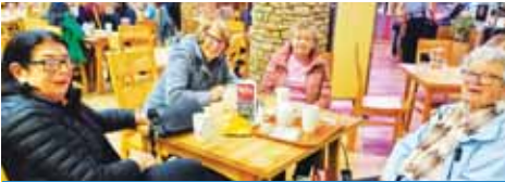
Barton Grange, November 2025