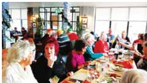
Llandudno Christmas Lunch - December 2025