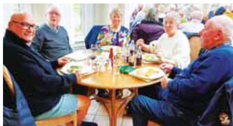
The Orangery, Derwen College, Oswestry February 2026