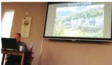
Virtual trip along the coast - February 2026