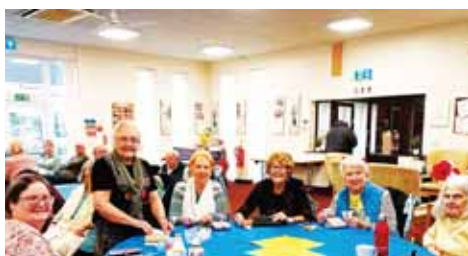
Virtual trip along the coast - February 2026