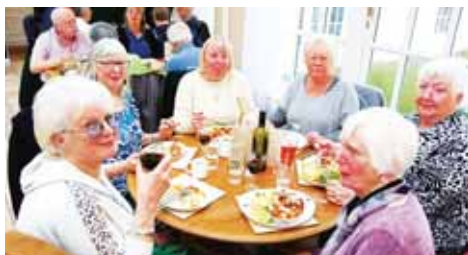
The Orangery, Derwen College, Oswestry February 2026