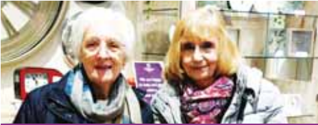
Barton Grange, November 2025