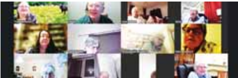
Thursday online quiz - November 25