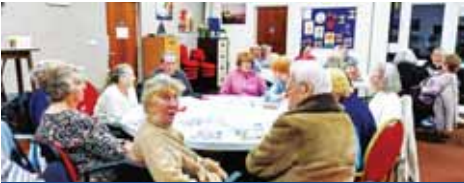
Fundraising, November 2025