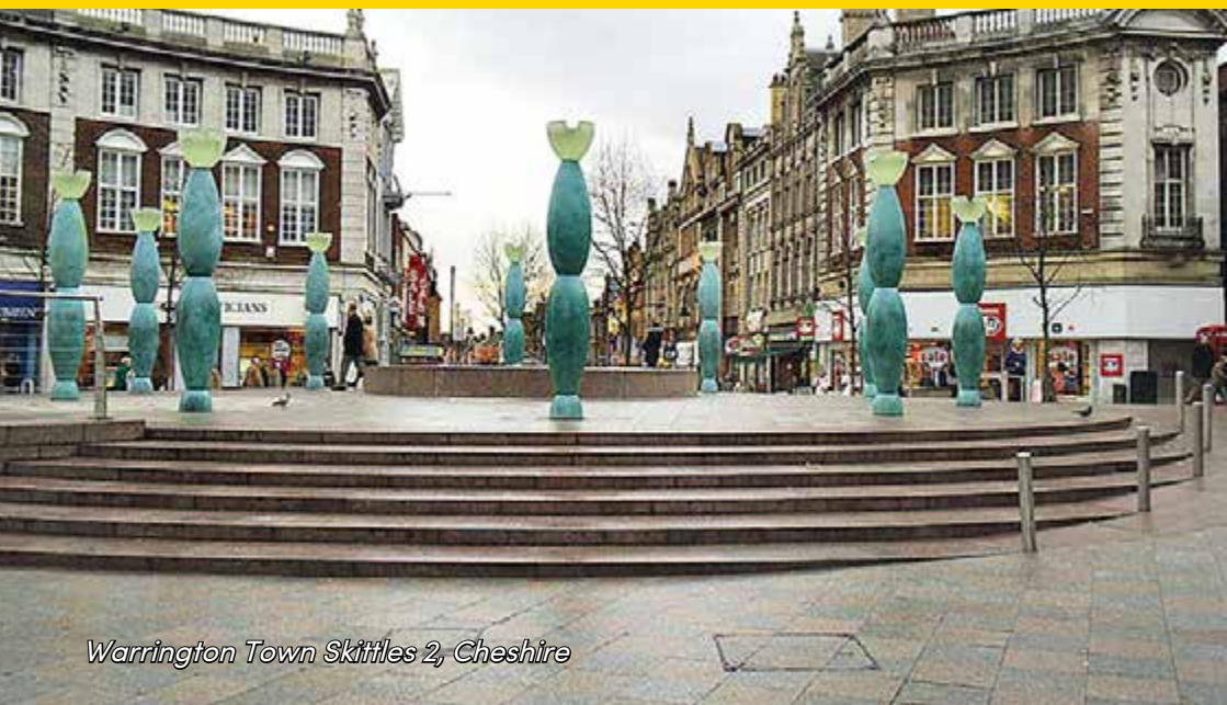
Warrington Town Skittles 2, Cheshire