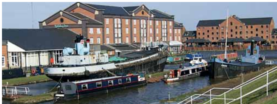
Waterways Museum and Cheshire Oaks – Tuesday 21 April 2020