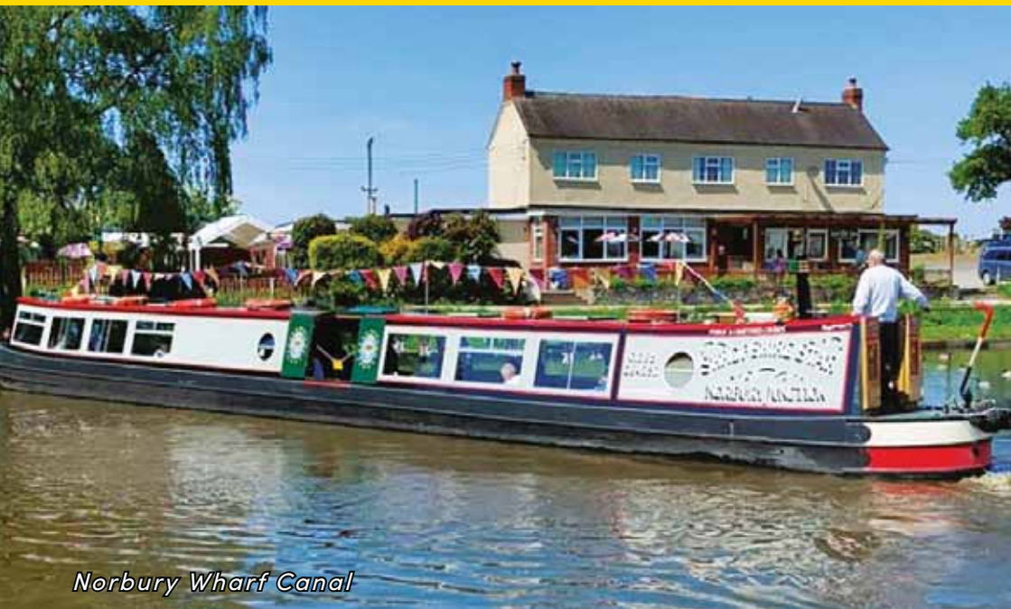
Norbury Wharf Canal