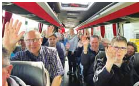
Oddies on the coach to Portmeirion

As well as business, attendees enjoyed a range of social activities, with Oddfellows Brass putting on another wonderful performance.