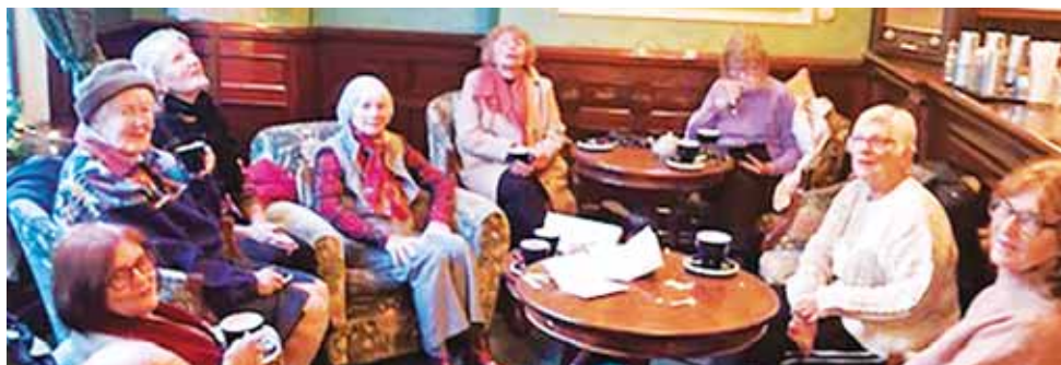
Members had a lovely coffee morning at The Cosy Club, Nottingham