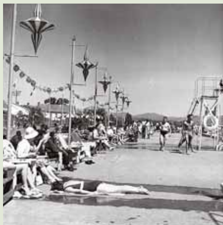
Gwersyll Gwyliau Butlins ym Mhwllheli