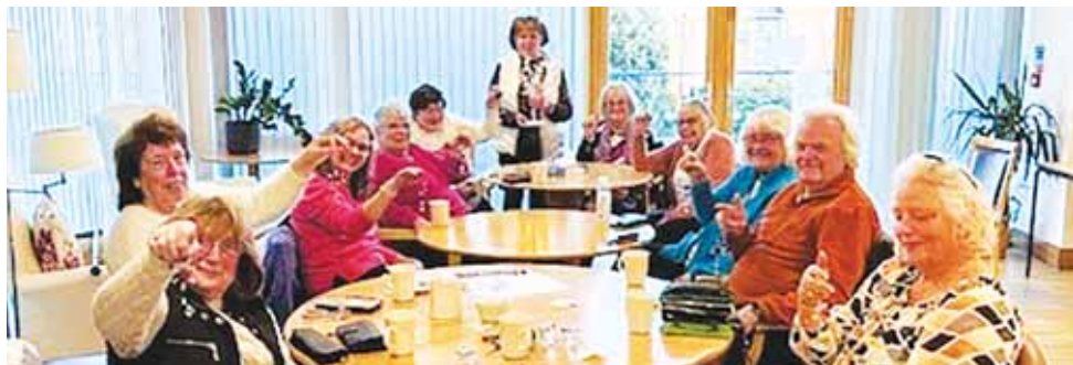
Members had a great time making Christmas Crystal Light Catchers