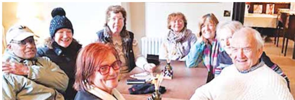
Members enjoyed lunch following their visit to Grantham House