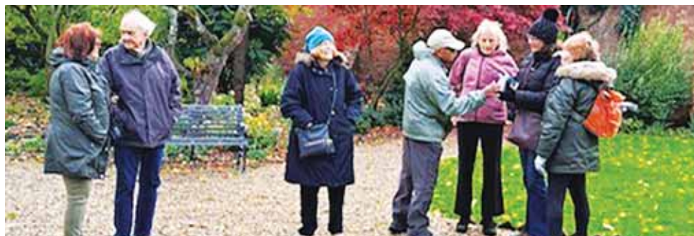
Members chatting in the grounds of Grantham House