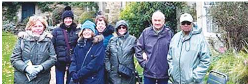
Members enjoyed an interesting visit to the historic Grantham House