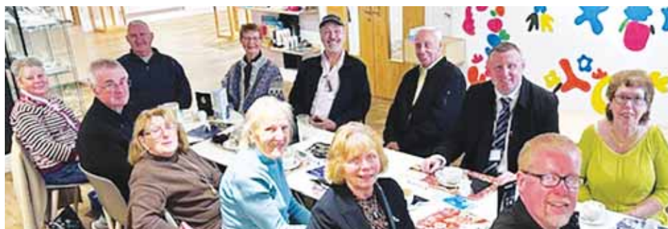
Members enjoyed their first meeting at The Hub. Sleaford