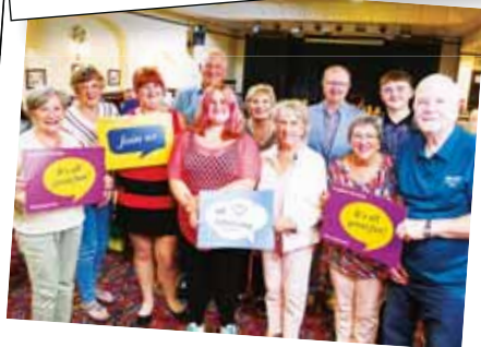
Brighouse and Huddersfield Oddfellows