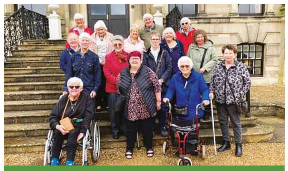
Members on an outing to Stoneleigh Abbey.