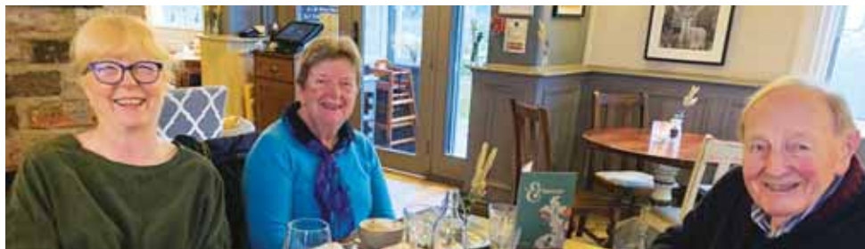
Lunch in Altrincham