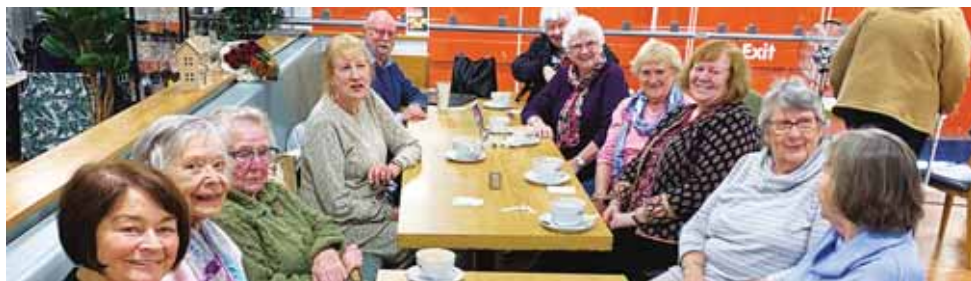
Altrincham coffee morning