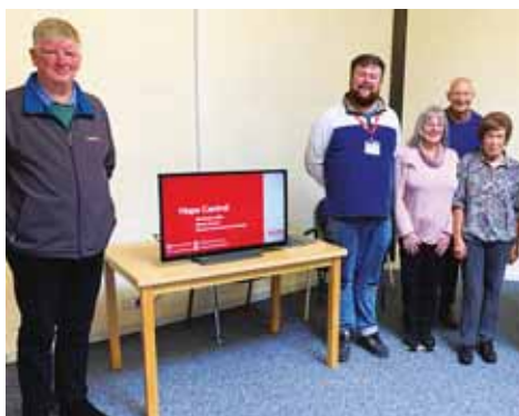
Talk by the Knutsford Food Bank