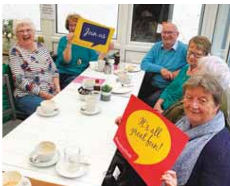
Macclesfield coffee morning