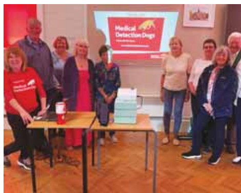
Medical detection dogs talk