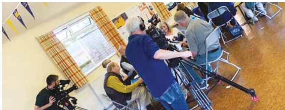
Indoor bowling and lunch with the BBC