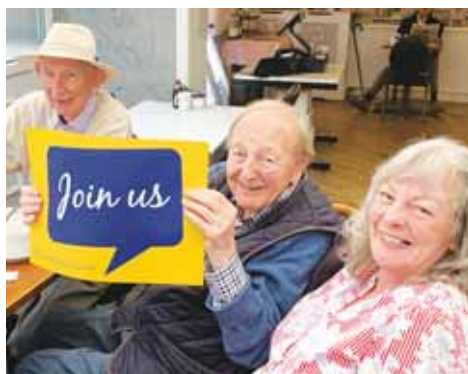
Macclesfield coffee morning