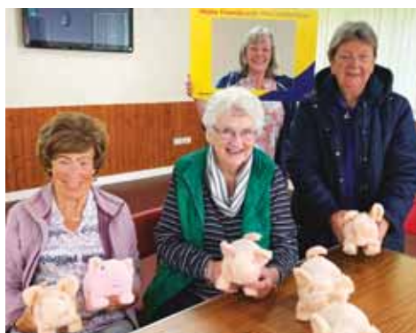
Coffee with the Oddfellows cuddly pigs