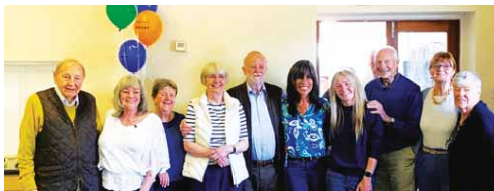
With BBC's Morning Live