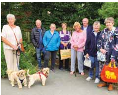
Altrincham in Bloom walk