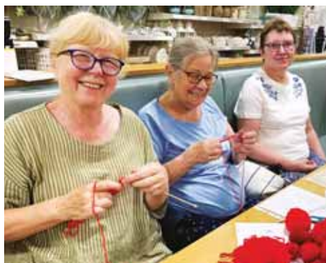
Altrincham coffee morning