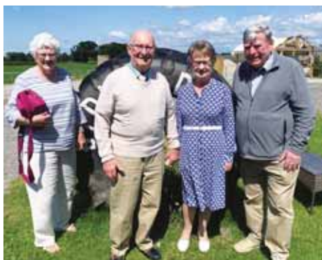
Ice cream at Bidlea Dairy