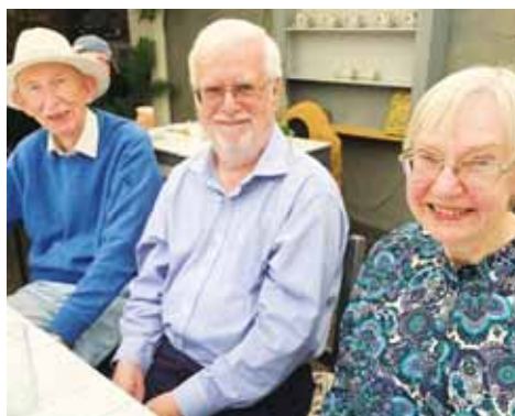
Macclesfield coffee morning