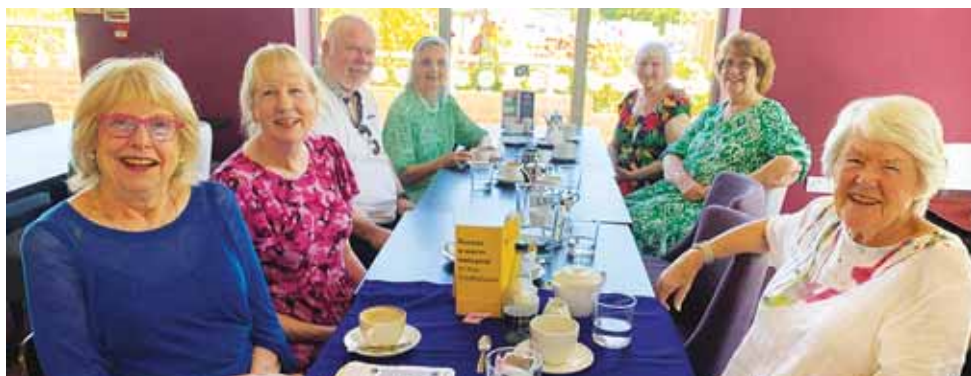
Wilmslow coffee morning