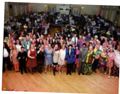
A 60s themed dance kicked off the celebrations at the Grand Master's Welcome Party