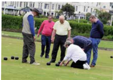
Oddfellows members enjoyed the annual bowls competition

With a jam-packed schedule mixing business with pleasure, AMC is a great opportunity for members to learn about the business side of the Society and our traditions, as well as meet and mingle with other Branches.