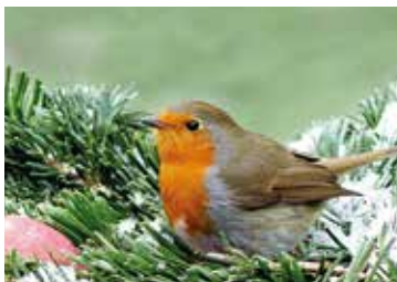
Wintertimes in the Garden