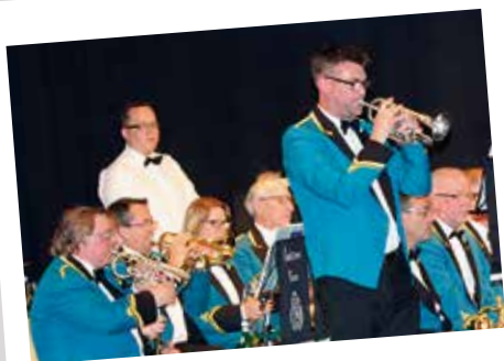
Oddfellows Brass gave a rousing public performance on Sunday