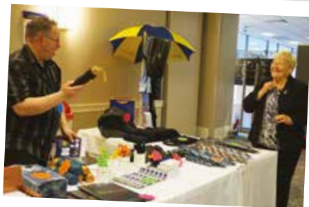
An array of Oddfellows merchandise was available for members to purchase

These include the Ken Hughes Silver Salver Award, won this year by Pride of Woolwich Branch, and the Lillian Ogden Recruitment trophy, awarded to Ormskirk and Southport Branch. Members can help their Branches to win awards too, as we also present the Refer a Friend Awards, to recognise Branches which have a great network of strong member advocates.