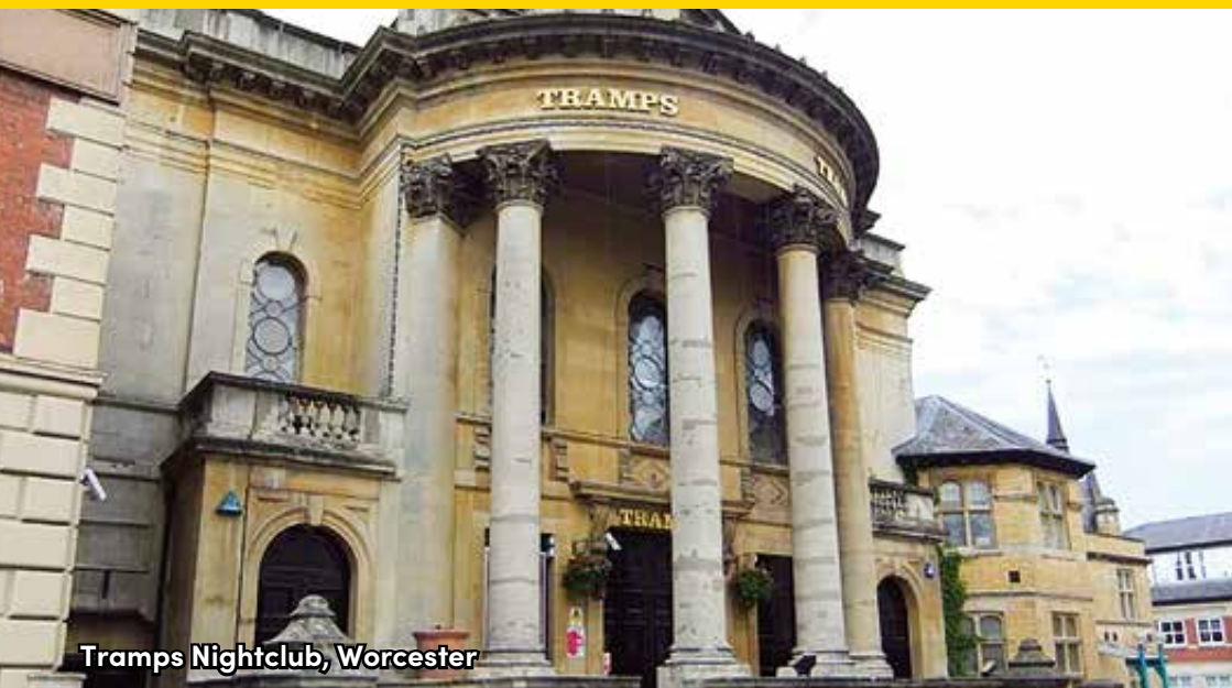
Tramps Nightclub, Worcester