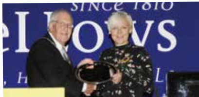
The "Refer a Friend" Award for the highest number of member advocates was awarded to Ormskirk and Southport Branch, with 31 members recruiting a new member in 2018