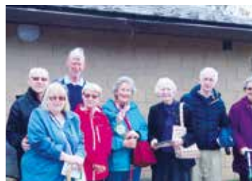
A walk through the woods