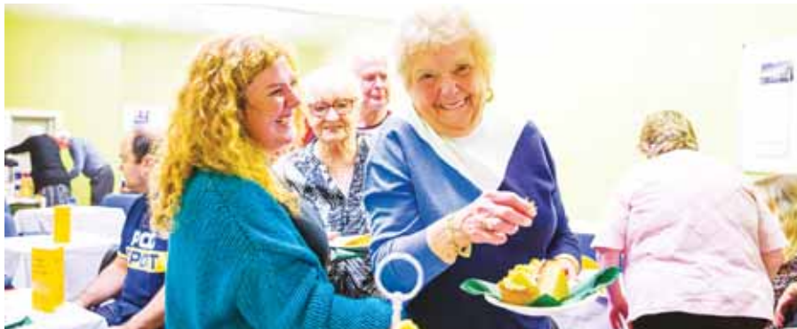
Cakes galore at Halifax Oddfellows