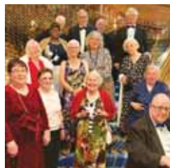
Dressed for dinner

“In the evenings there was varied entertainment in the main theatre but also music in the bars to suit all tastes. Of course, there was plenty to eat and drink too!”