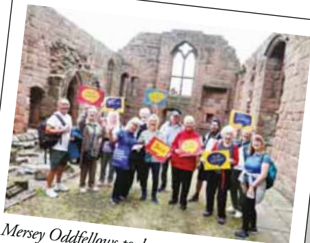
Mersey Oddfellows took a walk in Birkenhead