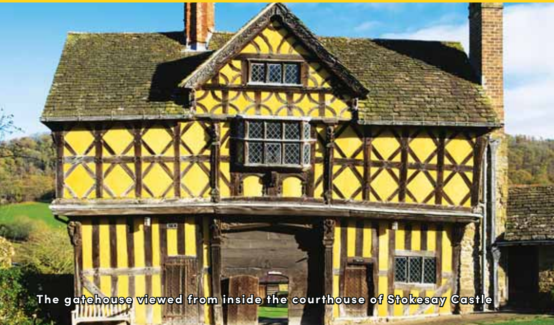
The gatehouse viewed from inside the courthouse of Stokesay Castle