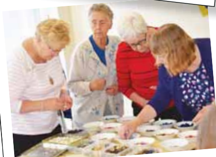
Bury St Edmunds Oddfellows getting crafty