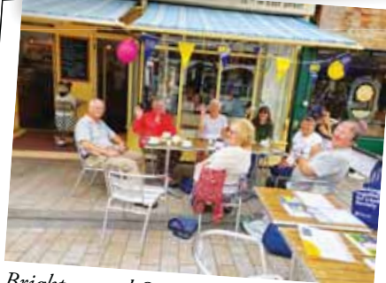
Brighton and Sussex Oddfellows enjoying a coffee morning