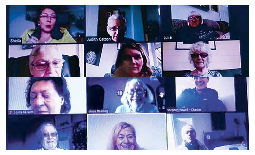
Join us online until we can meet face to face

Is there someone you know who'd enjoy what we do?