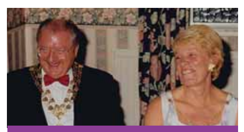
Happy times with the Oddfellows