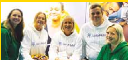
Unity Mutual at the Baby and Toddler show

The Junior ISA (JISA), offered in partnership with Mini First Aid to include a free paediatric first aid course*, turned heads, especially when parents realised once they'd set it up, anyone could contribute.