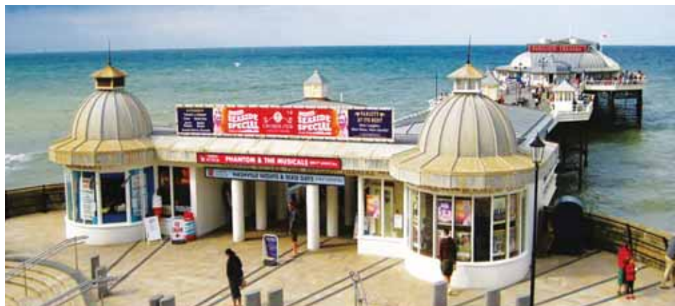
Cromer End of the Pier Show (City of Norwich Branch) – Thursday 25 July

We welcome all our members to the spring and summer edition of your events Diary and Newsletter for the Norwich District Oddfellows.