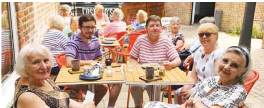
Delicious pancakes at a Handforth and Altrincham event.