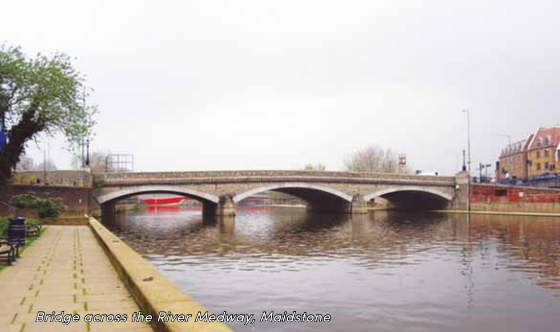
Bridge across the River Medway, Maidstone