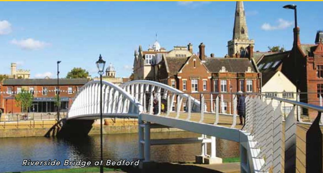
Riverside Bridge at Bedford