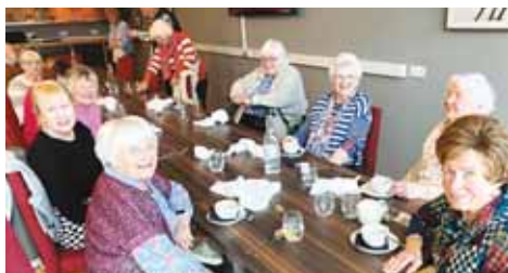
Lunch at Aspire, Trafford College