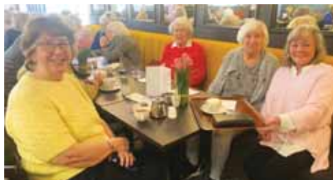
Wilmslow Coffee Morning