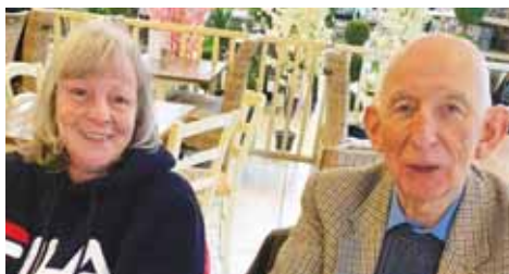
Macclesfield Coffee Morning