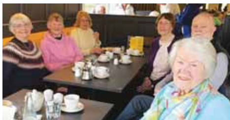
Wilmslow Coffee Morning