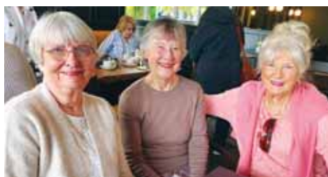
Wilmslow Coffee Morning