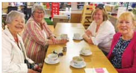
Altrincham Coffee Morning