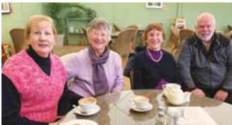
Knutsford Coffee Morning