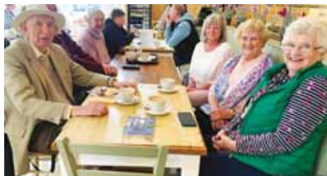
Macclesfield Coffee Morning