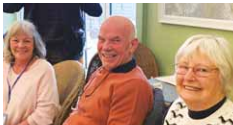
Knutsford Coffee Morning