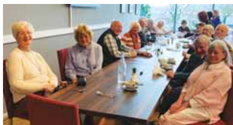
Lunch at Aspire, Trafford College