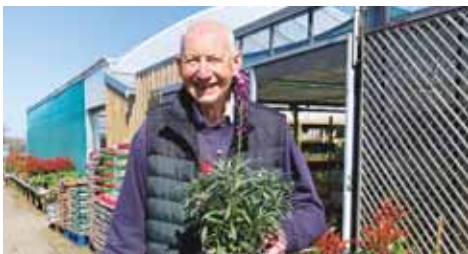
ESmith & Son