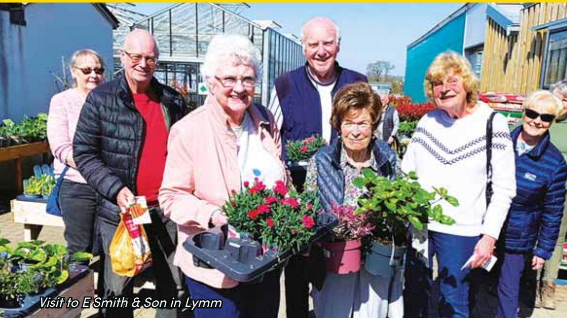
Visit to E Smith & Son in Lymm