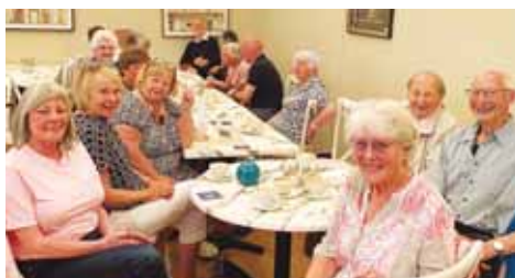
Knutsford Coffee Morning