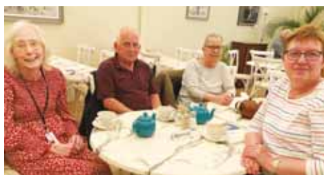
Knutsford Coffee Morning