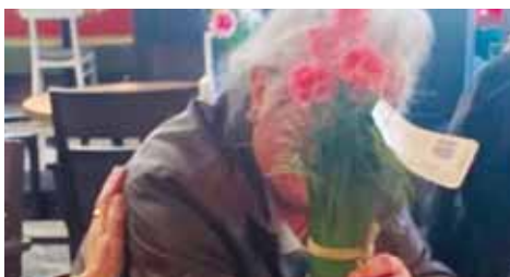
Wilmslow Coffee Morning