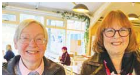
Macclesfield Coffee Morning