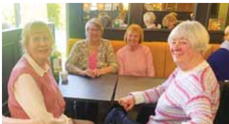
Wilmslow Coffee Morning