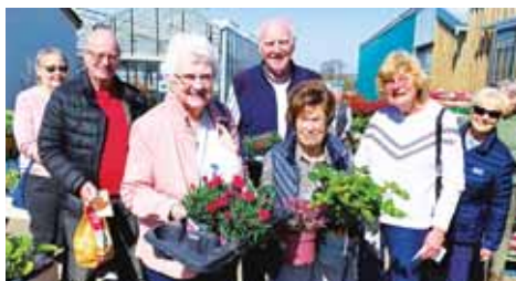
Visit to E Smith & Son in Lymm