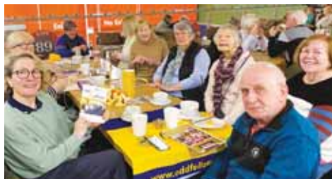
Altrincham Coffee Morning