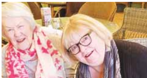
Knutsford Coffee Morning