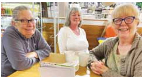
Altrincham Coffee Morning