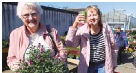
ESmith & Son