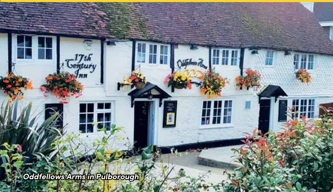
Oddfellows Arms in Pulborough