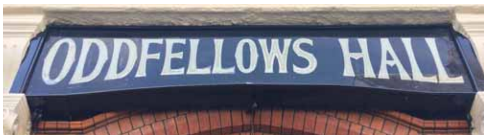
Oddfellows Hall Dorking