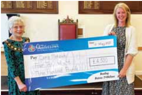
Reading Oddfellows donated £4,300 to Camp Mohawk

Oddfellows branches and members are avid fundraisers. In 2025, more than £148,000 was handed over to a huge range of wonderful causes throughout the country.