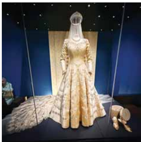
We had a wonderful time looking at the late Queen's outfits at the Queen Elizabeth II, her life in style Exhibition.