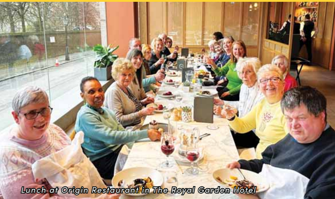
Lunch at Origin Restaurant in The Royal Garden Hotel