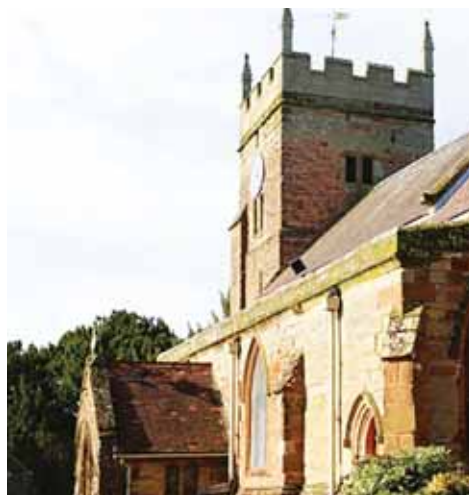
District Church Service Sunday 13 July