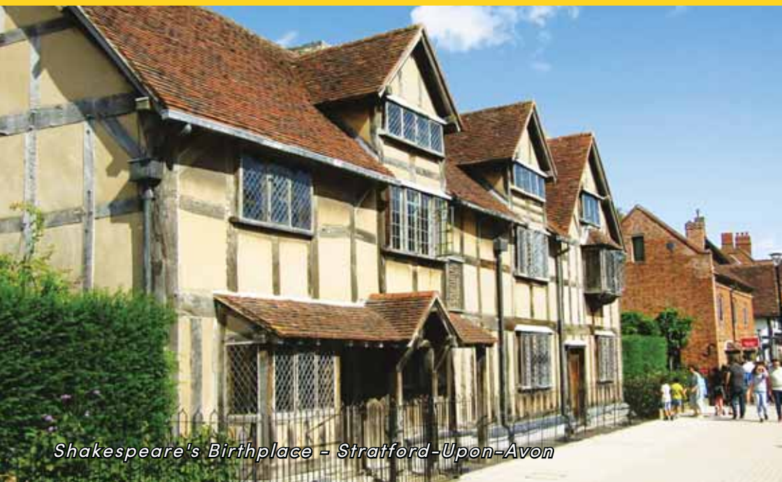
Shakespeare's Birthplace - Stratford-upon-Avon