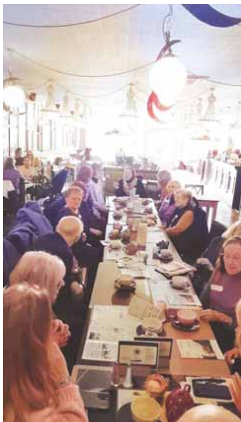
Our new coffee morning at Stratford Upon Avon.