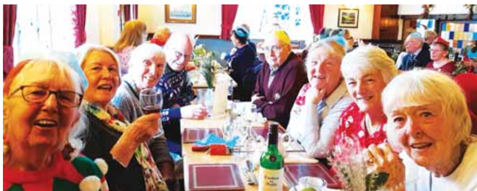
Members happily waiting for their Christmas meal.