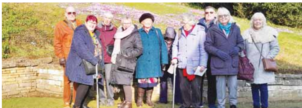
Members on a trip to a snowdrop walk.