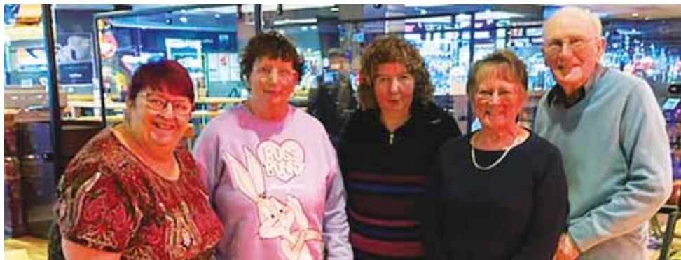
A regular group of Heart of England who go ten pin bowling.