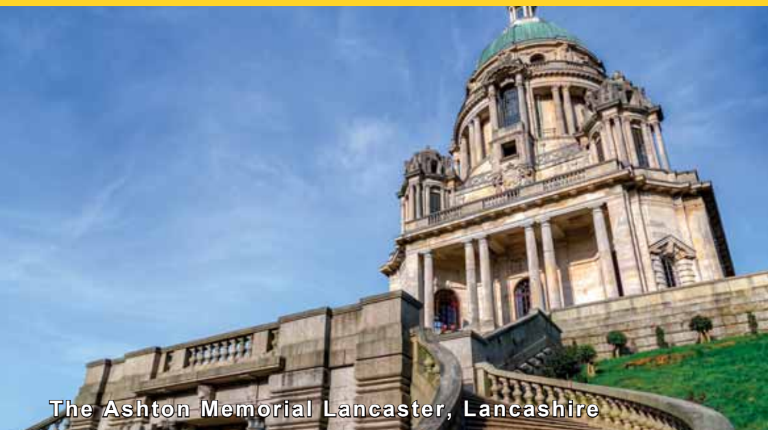
The Ashton Memorial Lancaster, Lancashire

Making Friends in Preston, Fylde and Lancaster