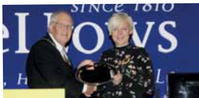
The "Refer a Friend" Award for the highest number of member advocates was awarded to Ormskirk and Southport Branch, with 31 members recruiting a new member in 2018