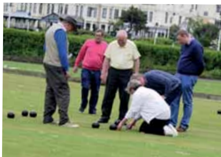
Oddfellows members enjoyed the annual bowls competition

With a jam-packed schedule mixing business with pleasure, AMC is a great opportunity for members to learn about the business side of the Society and our traditions, as well as meet and mingle with other Branches.