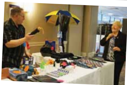
An array of Oddfellows merchandise was available for members to purchase

These include the Ken Hughes Silver Salver Award, won this year by Pride of Woolwich Branch, and the Lillian Ogden Recruitment trophy, awarded to Ormskirk and Southport Branch. Members can help their Branches to win awards too, as we also present the Refer a Friend Awards, to recognise Branches which have a great network of strong member advocates.