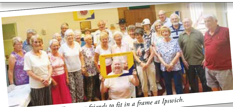
Too many friends to fit in a frame at Ipswich.