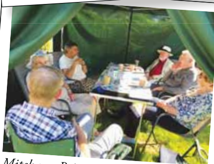
Mitcham, Reigate and Crawley friends keeping cool from the sunshine.