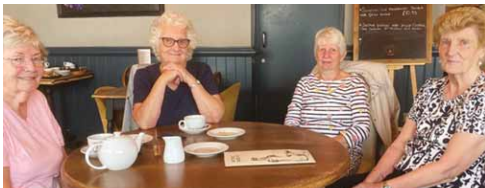
Wildfowler coffee morning and lunch club