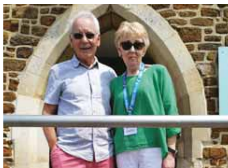
Lunch at the Golden Lion hotel in Hunstanton

All of the above are planned again for next 6 months.