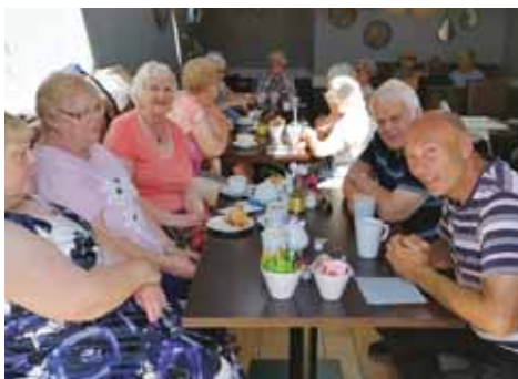
Coffee morning at Thaxters