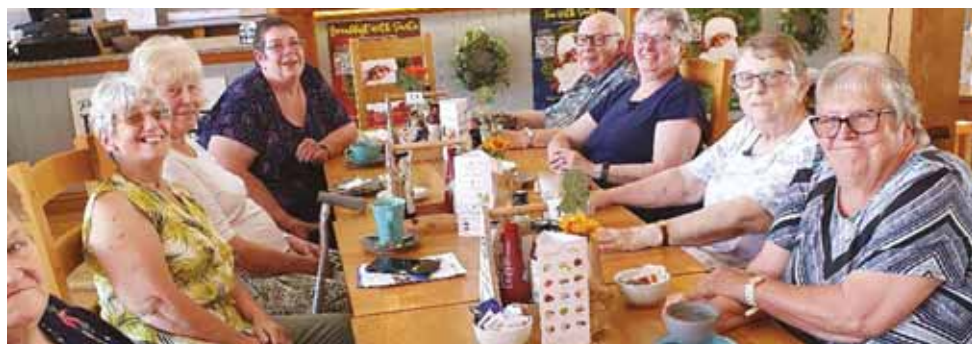
Hilgay at Downham