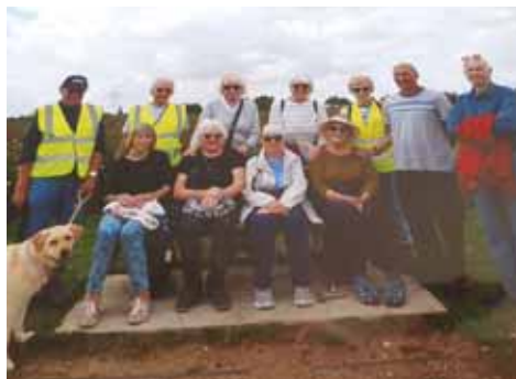
Walk and walk picture