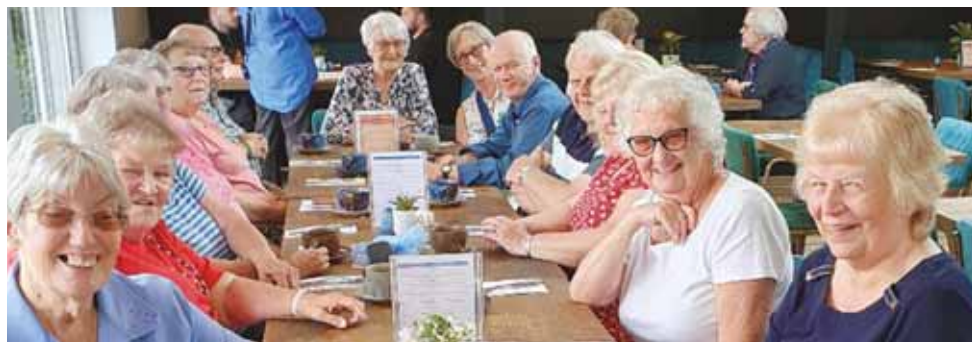
Downham market garden centre