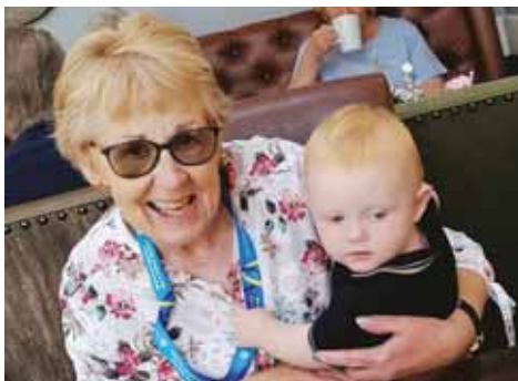
Coffee morning at Thaxters