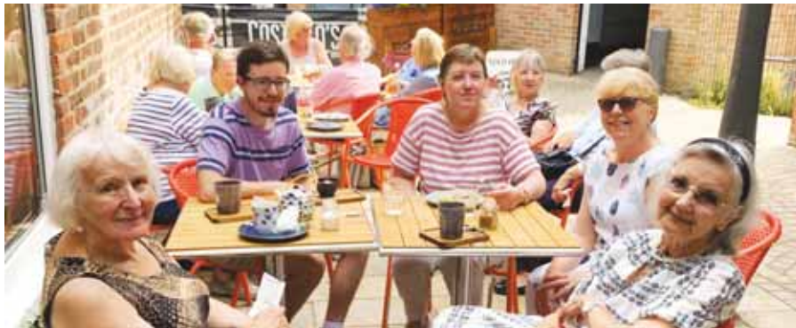
Delicious pancakes at a Handforth and Altrincham event.