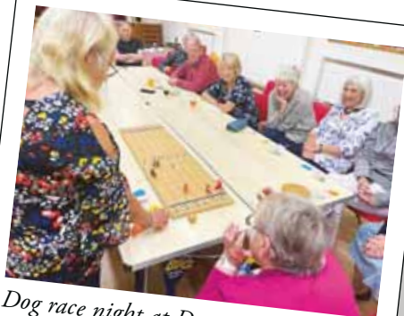
Dog race night at Dorset and Yeovil.