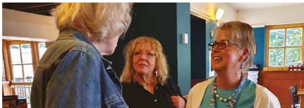
Globe coffee morning