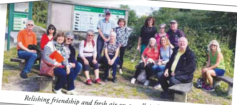
Relishing friendship and fresh air on a walk in Nottingham Trent.