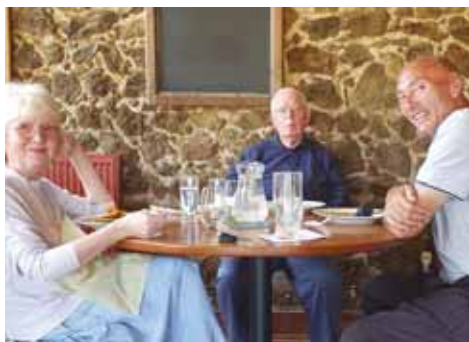
The Farmers Arms at Knights Hill Hotel