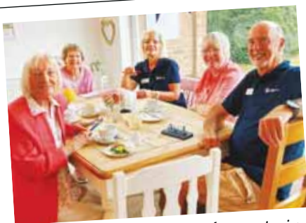
Brighton and Sussex members enjoying a coffee morning.

Take a look at some of the fun that's been had by some of our Branches!