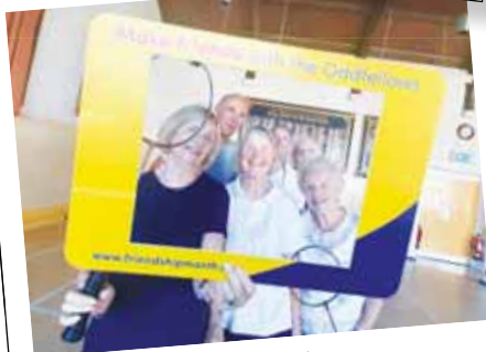
A friendly game of badminton in Mid-Surrey.